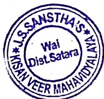
Principal, Kisan Veer Mahavidyalaya, Wai